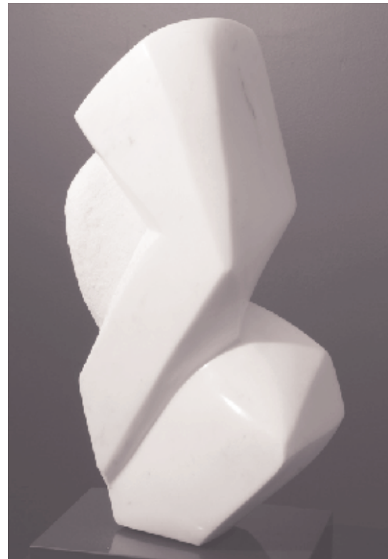
Sculpture by Edith Rae Brown , "A Moment Together", white Carrara marble.