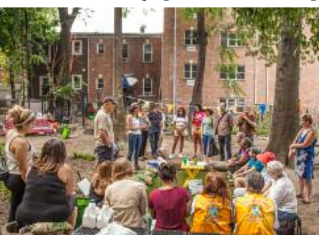
A meeting of the Immigrant Artist Program

Having spent our lives in the artistic community, we have lived through periodic Draconian cuts to the arts. We have seen arts programs have their funding slashed or ended. We have endured government disregard for the value