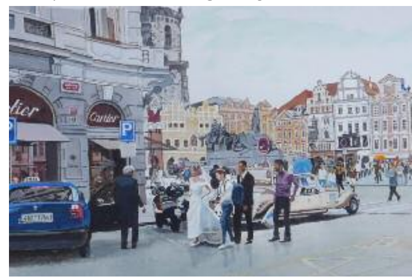
Charles McVicker, Wedding at Prague, Acrylic, 22" x 29"