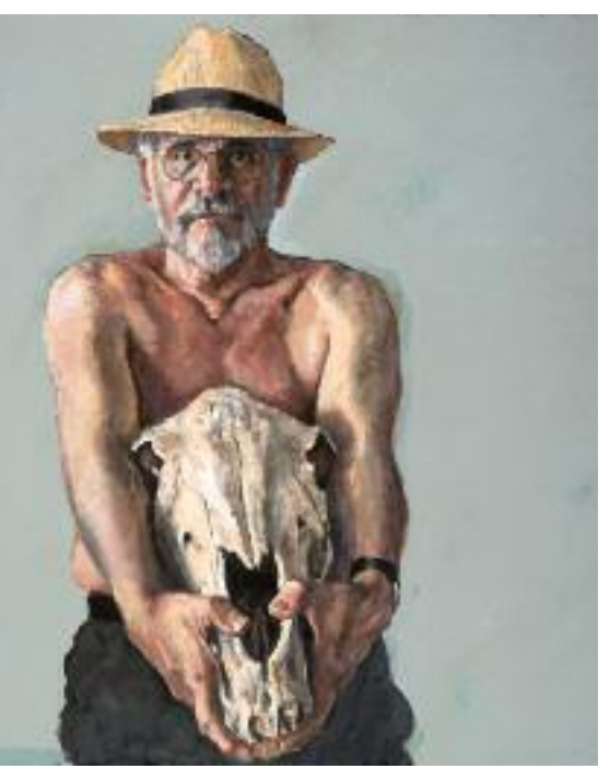
Sigmund Abeles, Self Portrait with Horse's Skull, Oil on panel, 24 x 20 inches, 2001